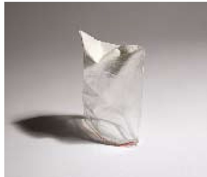
Ghosts , 2008, c-print, 11x13 cm each